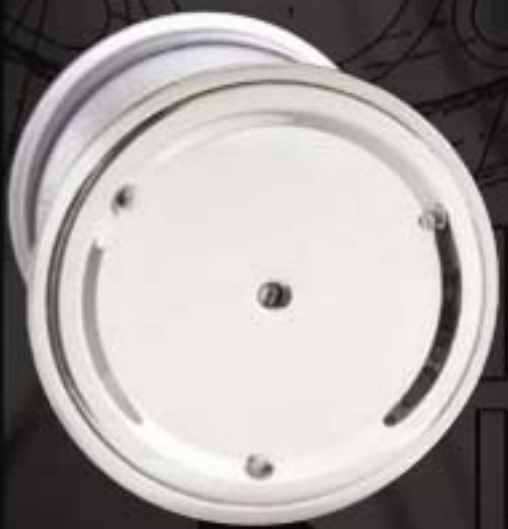
735-51756 15" Magnum Sprint Spline Bead-Loc™ with Ultra-Cover™ Shown Design Patent Pending